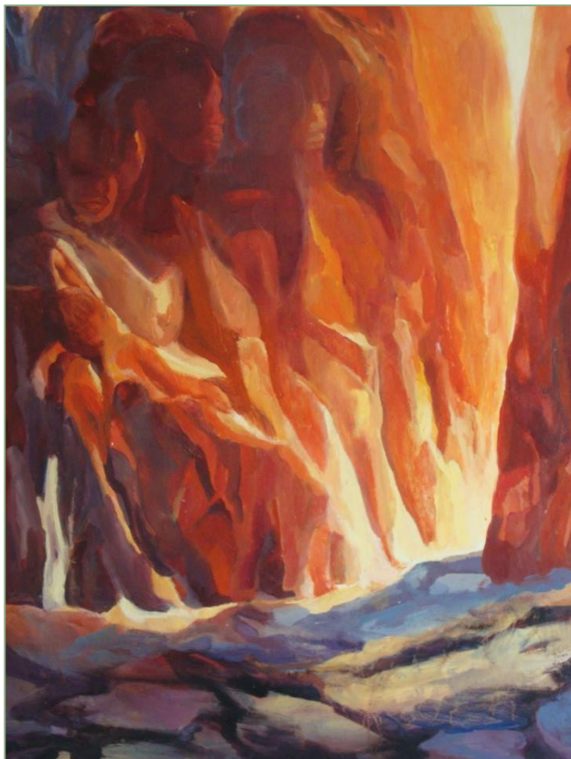
Rest and Light in a Gorge (Oil)