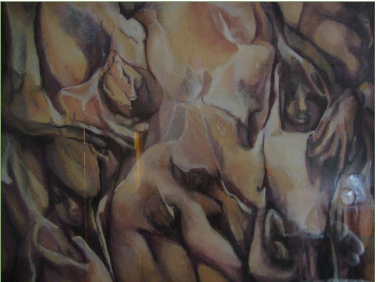
Figures in Stone (oil)