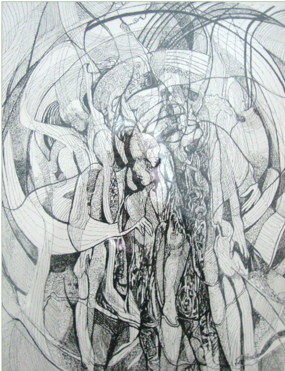
Cycle of Life (Pencil and Ink)