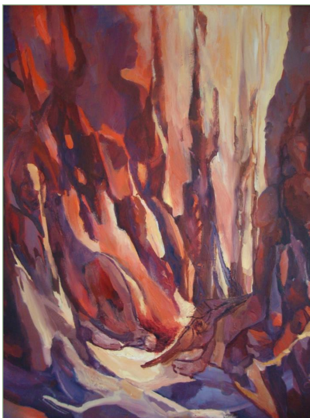
Shelter in a Gorge (Oil)