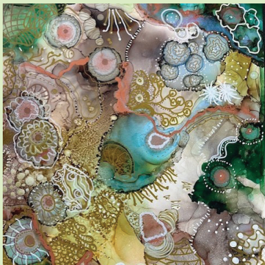
Garden of the Sea—Chris Farrell