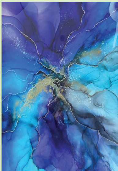
Citrus Magic Blue Mocktail—Olga Kamysheva